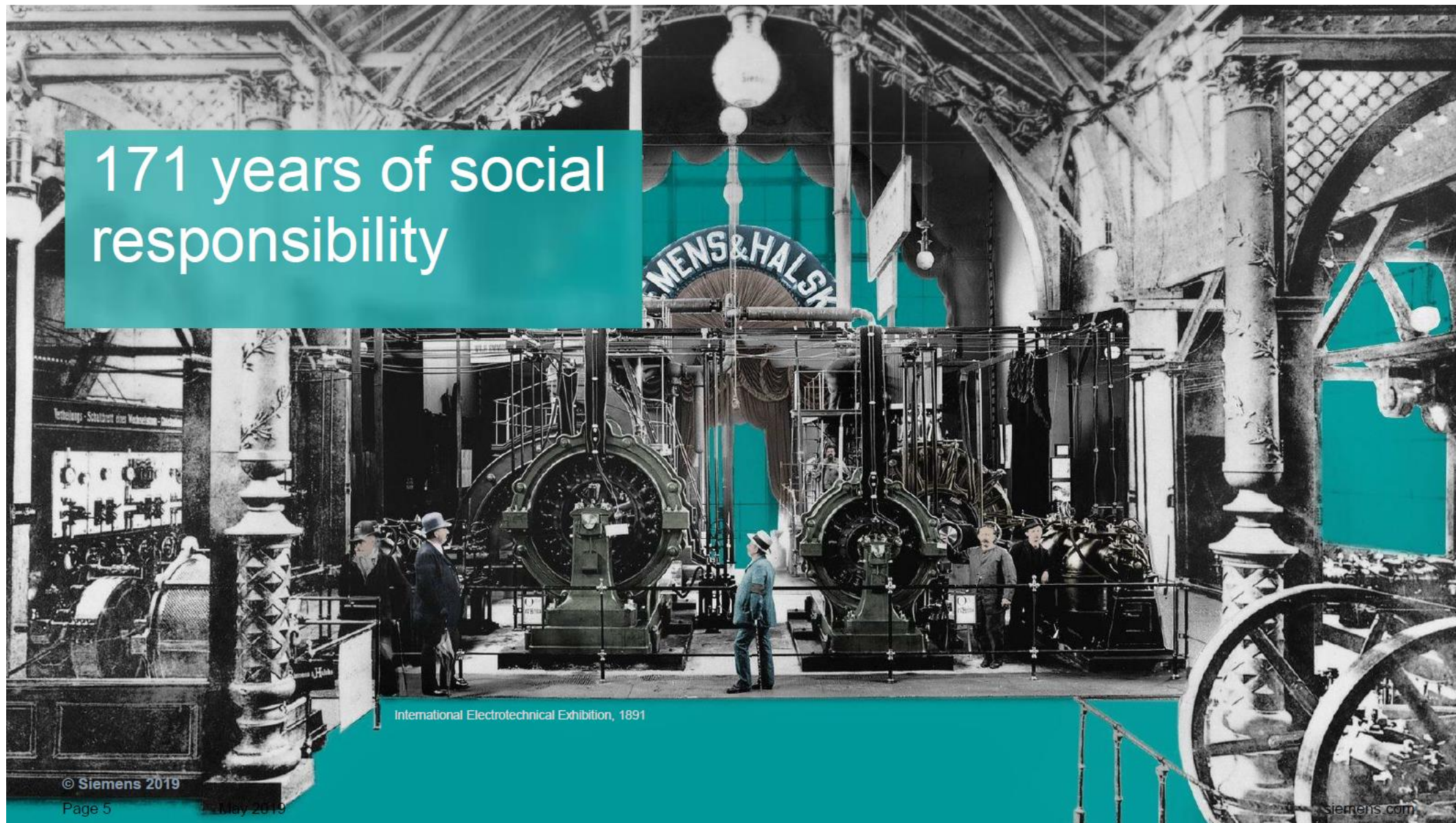
International Electrotechnical Exhibition, 1891